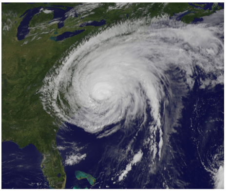
GOES-13 satellite image of Hurricane Irene after it made landfall in Cape Lookout, NC.